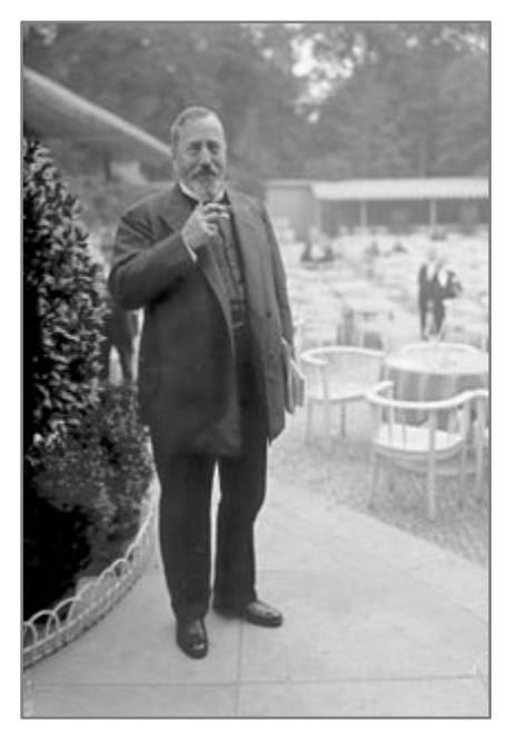
Bernhard Dernburg (July 1931)

on the side of Great Britain and France. To them the invasion of the little kingdom of Belgium and the horrors that accompanied German occupation were odious in the extreme. Moreover, they regarded the German imperial government as an autocratic power wielded in the interest of an ambitious military party. The kaiser, William II, and the crown prince were the symbols of royal arrogance. On the other hand, many Americans of German descent, in memory of their ties with the Fatherland, openly sympathized with the Central Powers; and many Americans of Irish descent, recalling their long and bitter struggle for home rule in Ireland, would have regarded British defeat as a merited redress of ancient grievances.