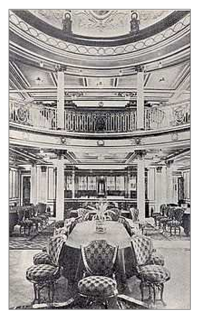
First class dining room in the Lusitania