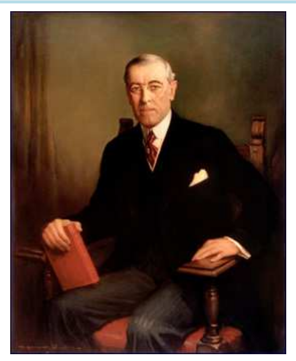
Official White House portrait of Woodrow Wilson

While the U.S. was battling national issues and conflicts, trouble was brewing in Europe and with the assassination of the Archduke Ferdinand one by one European nations and finally the U.S. were forced to become involved in the war in order to stop Germany's aggression.