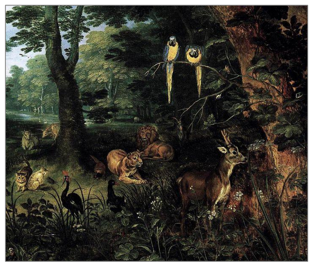
Paradise, by Jan Brueghel the Younger (c.1650)