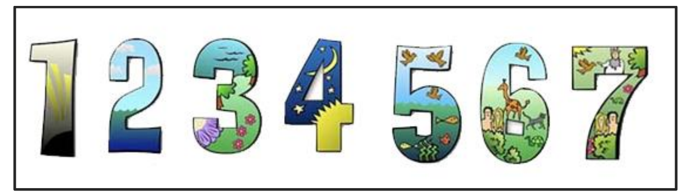
And God said . . .

When God made people, He made them male and female, and He gave them the wonderful gift of marriage. Then He gave them the special job of cultivating the earth. Once He finished creating the world, He rested, blessing that day as a special day of rest.