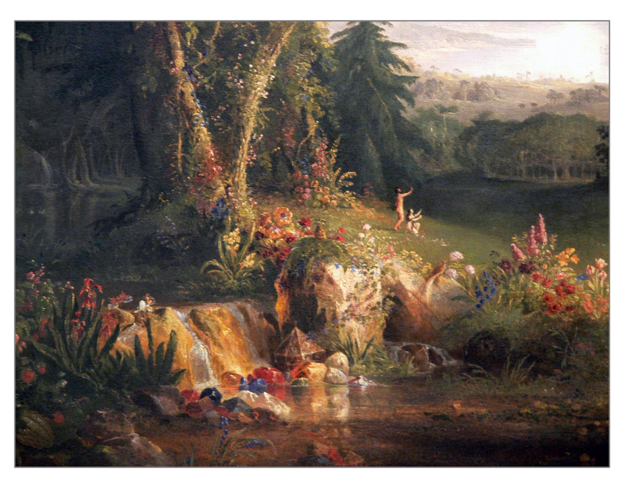
The Garden of Eden, by Thomas Cole (1828)

14 And the name of the third river is Hiddekel: that is it which goeth toward the east of Assyria. And the fourth river is Euphrates.