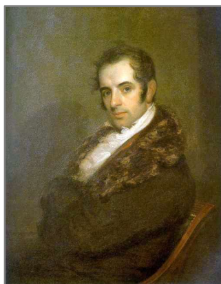
Washington Irving, by John Wesley Jarvis (1809)