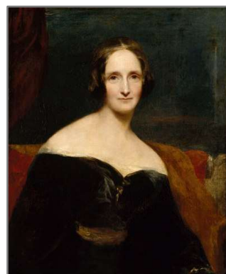
Mary Wollstonecraft Shelley, by Richard Rothwell (1840)