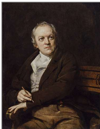
William Blake, by Thomas Phillips (1807)