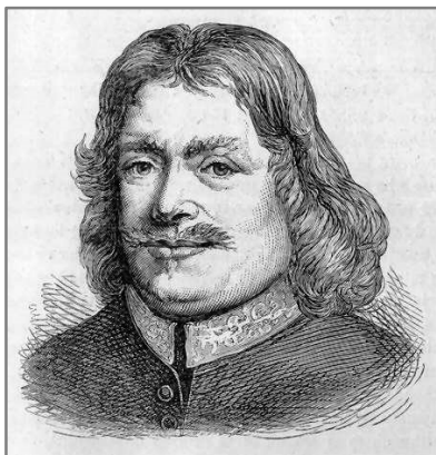
John Bunyan